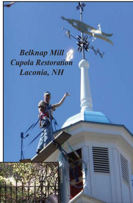
Belknap Mill Cupola Restoration Laconia, NH

Projects related to all chapters of American history are eligible for consideration. Extra consideration is given to those that relate to the Colonial or Federal periods. The maximum award is $10,000. Smaller projects are encouraged.