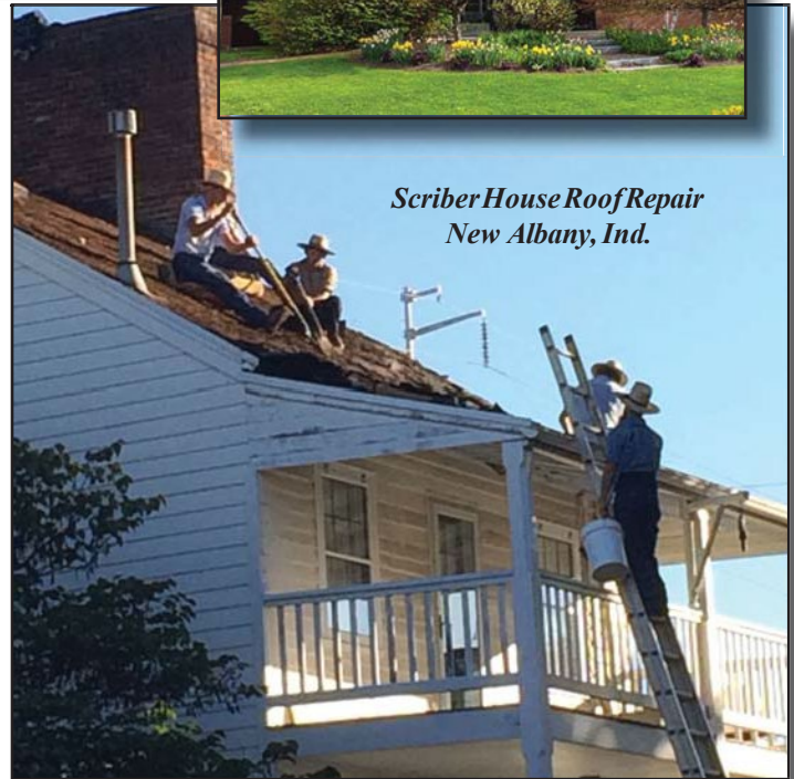
Scriber House Roof Repair New Albany, Ind.

To learn more about applying for DAR Historic Preservation Grants, visit: www.DAR.org/grants .